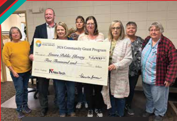
Check presentation to the Lenora Public Library.