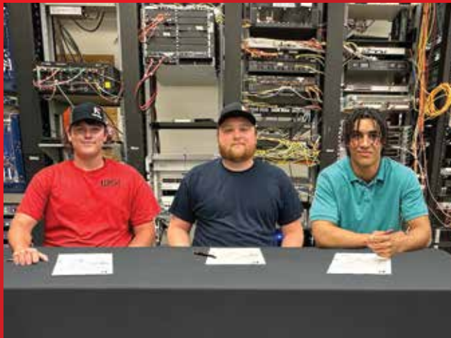
Signing day for recipients of the 2024 Technology Education Sponsorships at Fort Hays Tech | North Central.