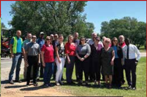
Kansas Office of Broadband Development visits Salina for a tour and update of grant-funded projects.