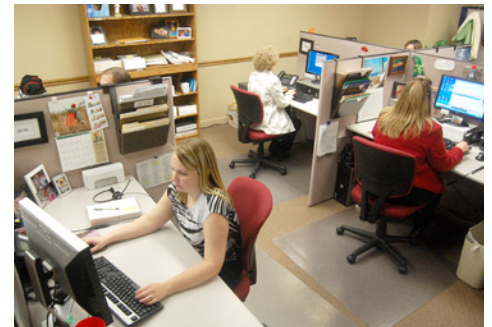
BMI's call center agents rely on the Toshiba Strata ACD and OASYS Tracer to manage thousands of incoming calls every week while also meeting government compliance requirements.